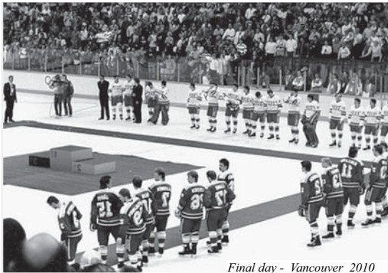
Final day - Vancouver 2010

to have tuned into the Games. Olympic rights holding broadcasters have offered Vancouver 2010 Winter Olympic Games coverage on more than 300 TV stations and on more than 100 websites worldwide. 47 per cent more global television coverage of the Games than for the Torino 2006 Olympic Winter Games. This represents approximately 24,000 hours of coverage, 50,000 hours of total broadcast hours of the Games across all media plat-