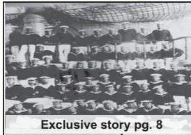
Exclusive story pg. 8